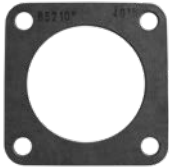
P/N 652105 P/N 652137