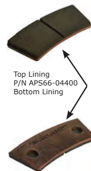
Top Lining P/N APS66-04400 Bottom Lining