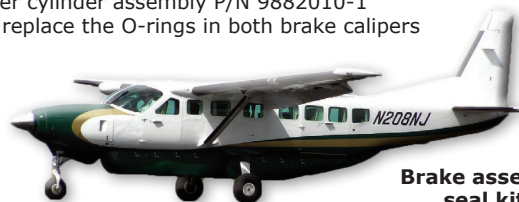
Brake assembly and master cylinder seal kits for Caravan brakes! See complete Caravan section