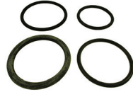
CBS-KT-6 Brake Caliper Seal Kit