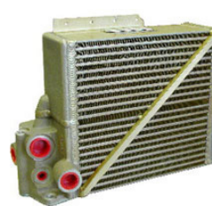
Rear Mount Oil Cooler P/N 8000464