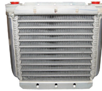
HE Series P/N 8001646