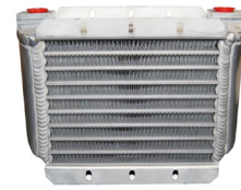
HE Series P/N 8001599

Important: To confirm FAA approved eligibility, verify that your current (or originally) installed oil cooler P/N is listed in the "FAA Approved Replacement for" column for your aircraft model.