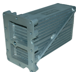
Front Mount, 12 Bolt Non Congealing Oil Cooler P/N 8000319