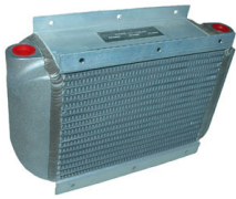
Bar and Plate P/N 8000356