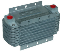
7 row drawn cup P/N 8000075